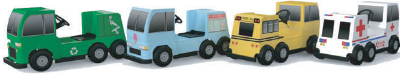
FIRE TRUCK AND FRIENDS