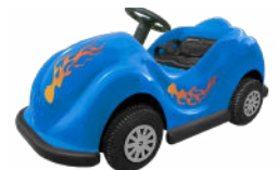
AQUA Fun model for an imaginative attraction.