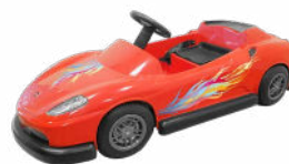
SPIDER Made for two, child and adult.