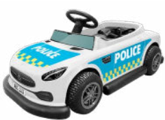
BENZA A Popular versatile model.

Up to 120 rides per hour based on a 5 min ride cycle. (10 vehicles minimum 150 m 2 , 1614 ft 2 .)