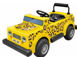
SAFARI Our popular, timeless model.