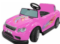
BENZA X Classic and sturdy.